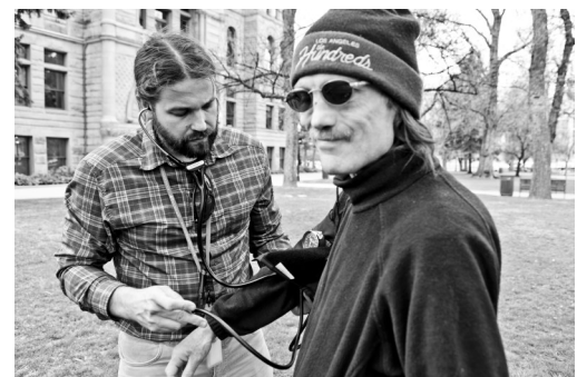
4th Street Clinic, Salt Lake City, UT