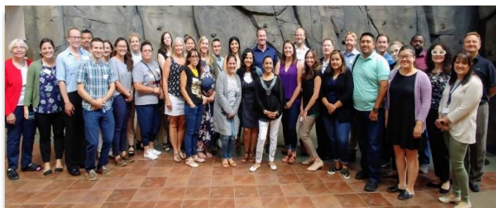
Participants and staff from all six Region VIII states during the training in Golden, CO.

Colorado Community Health Network (CCHN) and CHAMPS hosted Community Health Dental Programs: Strategies for Success August 1-2, 2019 in Golden, CO. Forty-five participants from 17 different health centers representing all six Region VIII states (CO, MT, ND, SD, UT, WY) attended the day and a half