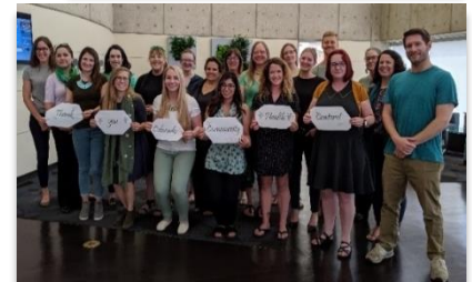
CHAMPS staff (top) joined Colorado Community Health Network (CCHN) staff (above) to honor CHCs and celebrate NHCW.