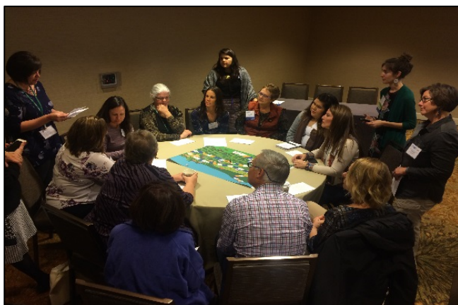
Annual Conference attendees test the Rural Social Determinants of Health Board Game .

We want to know what you think! Please take a couple minutes between now and Friday, March 15, 2019 to evaluate the CHAMPS Quarterly Newsletter by visiting https://www.surveymonkey.com/r/CHAMPSNewsletterEval2018 . Participants will have the chance to win a $35 Amazon gift card!