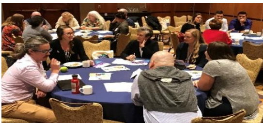
Pictured above: Annual Conference attendees participate in a round table discussion during a conference session.

Video recordings of sessions from the 2019 CHAMPS/NWRPCA Annual Primary Care Conference, which was held October 5-8, 2019 in Seattle, WA, are now available to conference participants via NWRPCA's Learning Vault (login required). Slides and other support materials are also available.