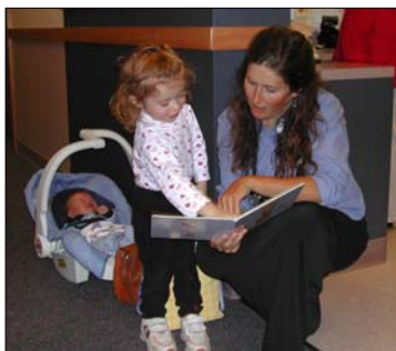
CHP literacy program staff and friends

Community Health Partners (CHP) is a Community Health Center in Livingston, a rural Montana community. Like other Community Health Centers throughout the country, CHP receives federal funding to provide health care for uninsured and low income individuals. Unlike other health entities, however, CHP steps outside the usual paradigm to address social factors not considered in most other health care systems. Specifically, in an attempt to address the root causes of poverty and health access, CHP is the only Community Health Center in the country with a full-fledged on-site adult, family, and pediatric literacy program.