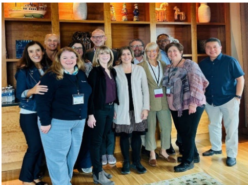
Representatives of NACHC and Region 18 PCA Leadership.

Overall, the 2023 NWRPCA/CHAMPS Annual Primary Care Conference was a great success! Thank you to all the participants, presenters, and NWRPCA and CHAMPS staff for making the event so special.