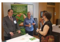
Exhibitors meet conference attendees between sessions.

Explore the CHAMPS Annual Primary Care Conference webpage to review conference highlights, link to session handouts (registrant password required), view a photo journal, and stay updated on plans for the 2017 conference in Seattle, WA.