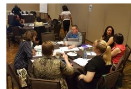
Conference attendees share ideas in a session.