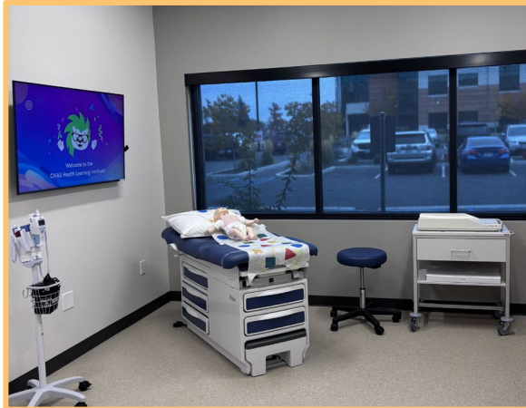
Thank you to the Community Health Association of Spokane (CHAS Health) for generously providing a tour of its Maple Street Clinic and Learning Institute!